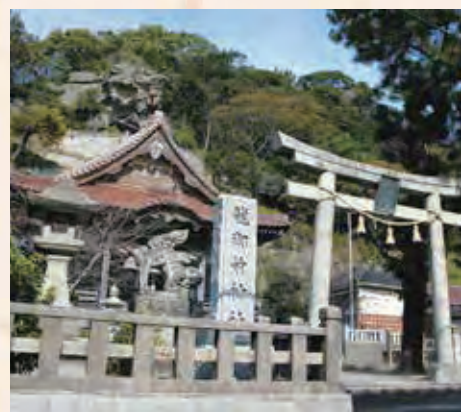
[Place] Tatsu-no-Gozen Shrine